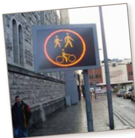
(VMS ar do bhealach isteach go Sráid Phádraig)

Is é an cuspóir an timpeallacht do choisithe agus an iompair phoiblí a fheabhsú ar Shráid Phádraig agus ar Phlás Emmet le linn príomh-thréimhsí le linn an lae.