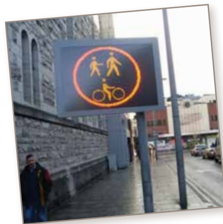
(VMS on approach to St. Patrick's Street)

The objective is to improve pedestrian and the public transport environment in St. Patrick's Street and Emmet Place during key periods during the day.